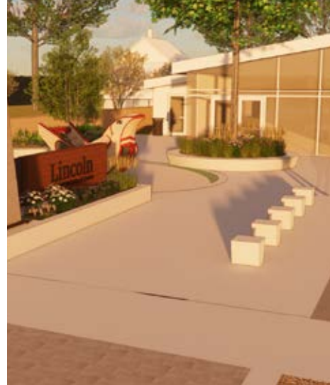
Museum courtyard rendering