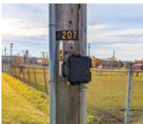
“Black cat” device