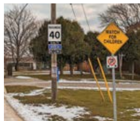
School zone signage