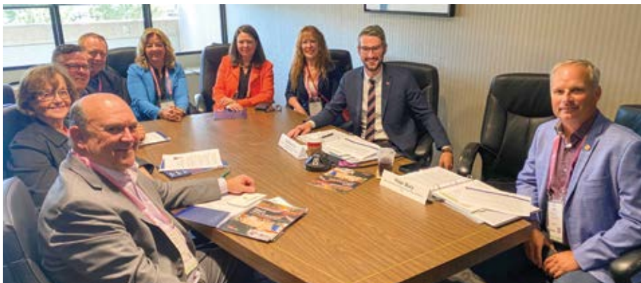
Members of Lincoln Council meet with the Ministry of Municipal Affairs and Housing to discuss funding for shared services and growth-related infrastructure pressures.