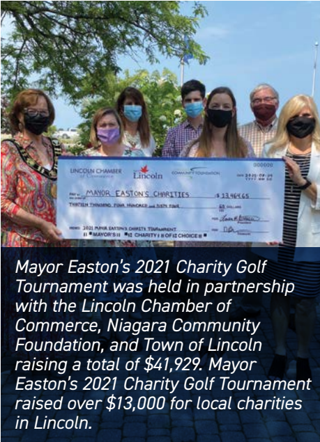
Mayor Easton's 2021 Charity Golf Tournament was held in partnership with the Lincoln Chamber of Commerce, Niagara Community Foundation, and Town of Lincoln raising a total of $41,929. Mayor Easton's 2021 Charity Golf Tournament raised over $13,000 for local charities in Lincoln.