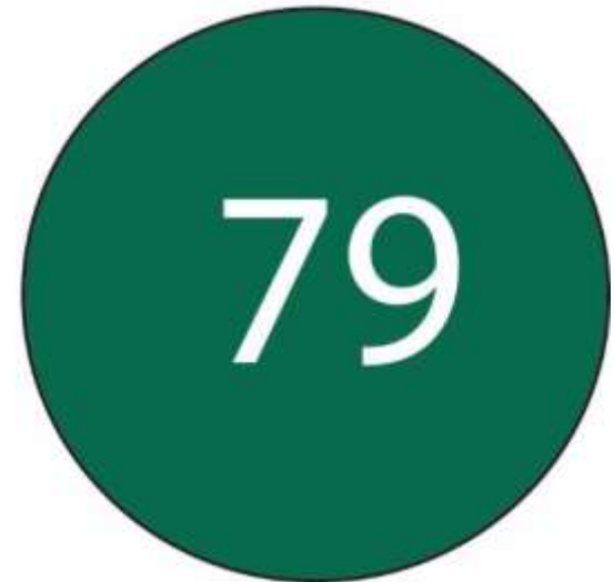
Complete or in progress, to date