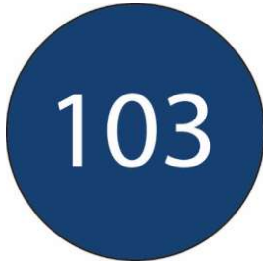
Total action items within plan